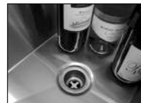
Includes 2-1/2" drain for easy water drainage

P rofessional Stainless Steel Products For Your Home