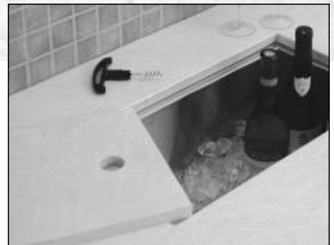
Shown with a reveal mount to accommodate a matching surface material sink cover (By others)