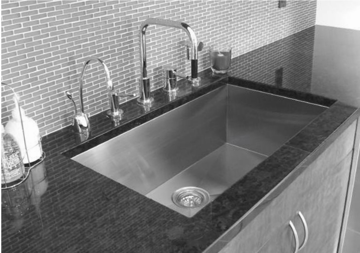
TR-3018-RE Large Capacity 28" x 16" x 10" Deep Sink Shown.