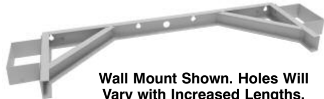
Wall Mount Shown. Holes Will Vary with Increased Lengths.